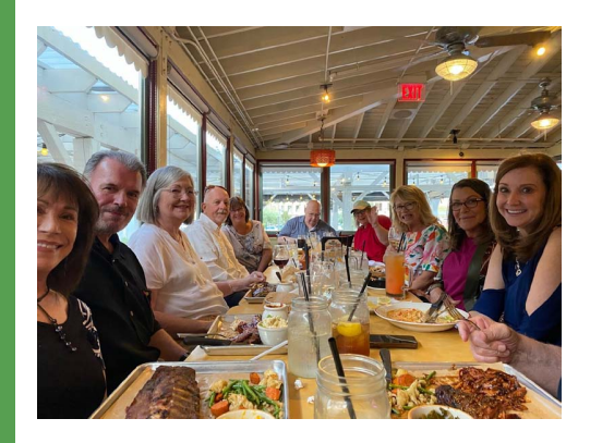
June 22 Meeting